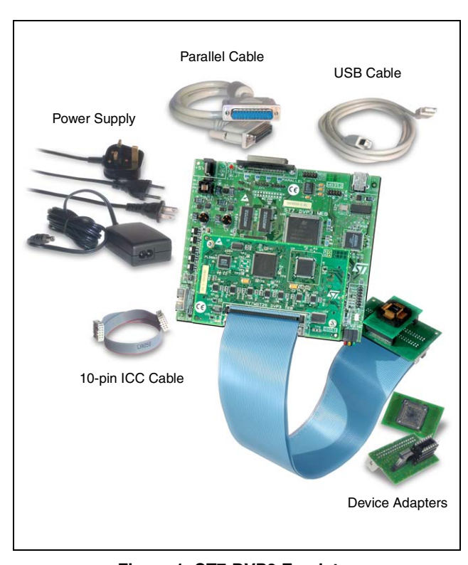
Figure 1: ST7-DVP3 Emulator

Main Emulation Board – Provides the communication interface with the host PC via parallel or USB connection when working in both the Emulation and ICC configurations. Any Main Emulation Board for the DVP3 series can be adapted to emulate a supported ST7 with the appropriate Target Emulation Board and Connection kit. This board also includes the system's ICC connection, which allows you to connect to the ST7 on your application board via a 10-pin ICC cable and an ICC connector that you install on your application board.